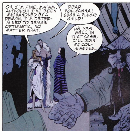
Figure 1: Pollyanna and Rosa Coote, from The League of Extraordinary Gentlemen, Volume 1 © 2000 Alan Moore and Kevin O'Neill, reprinted with kind permission of the authors.

The scene in question takes place at a "Correctional Academy for Wayward Gentlewomen" (Moore & O'Neill 2000: [42]), where the students include a number of characters from late nineteenth- and early twentieth-century children's novels, including Katy Carr of Susan Coolidge's What Katy Did (1872), Rebecca Randall of Kate Douglas Wiggin's Rebecca of Sunnybrook Farm (1903), and Pollyanna, the ever-optimistic protagonist of the Pollyanna novels, also known as the Glad Books (1913-1951), 6 originated by Eleanor H. Porter and continued by four other authors. 7