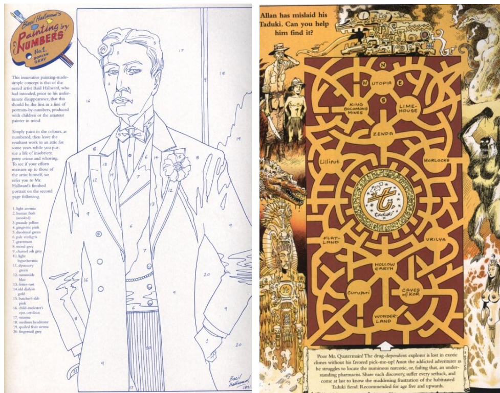
Figures 4 and 5: 'Basil Howard's Painting by Numbers' and Quatermain's Taduki Game, both from The League of Extraordinary Gentlemen, Volume 1 © 2000 Alan Moore and Kevin O'Neill, reprinted with kind permission of the authors.

comics, but, in keeping with the rest of the series, he subverts common associations between games and childhood by pairing traditional children's pastimes (such as puzzles, board games, and craft projects) with unlikely subjects. The games find their humour in literary gags, including, for instance, 'Basil Howard's Painting by Numbers', featuring Dorian Gray (Moore & O'Neill 2000: [187]), and in incongruous combinations of children's activities and adult themes. One game, "[r]ecommended for age five and upwards" (Moore & O'Neill 2000: [191]), instructs the reader to help the drug-addled Quatermain hunt for narcotics; again, the game explicitly and satirically figures the reader as a young child.