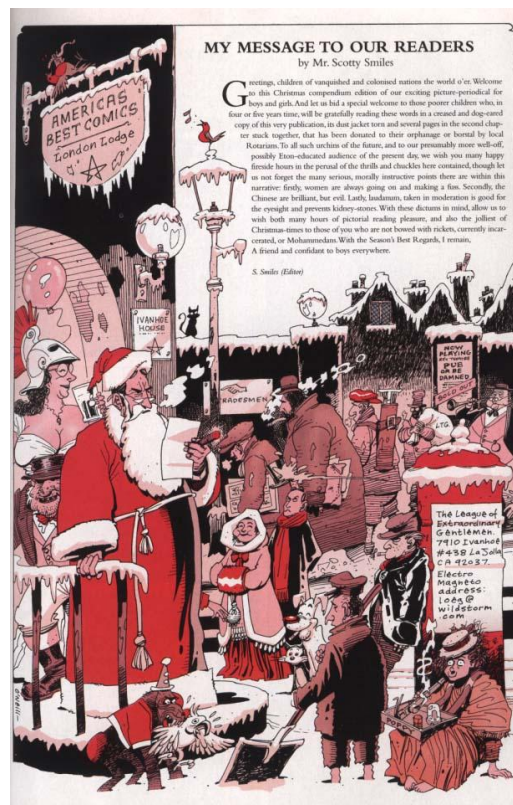
Figure 3: Editor's letter, from The League of Extraordinary Gentlemen , Volume 1 © 2000 Alan Moore, and Kevin O'Neill, reprinted with kind permission of the authors.